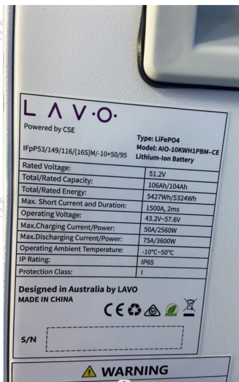
Figure 4 Battery Label (标签图)